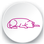
Lethargy/lack of energy