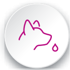
Discharge from the nose or eyes