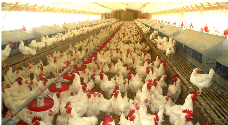
Figure 1. Standard growth house for broiler breeders.

Coccivac®-D2 contains six coccidia species ( Eimeria acervulina , E. brunetti , E. maxima , E. mivati , E. necatrix , and E. tenella ). It is intended for birds grown beyond eight weeks of age, such as commercial layers or broiler/layer breeder replacements.