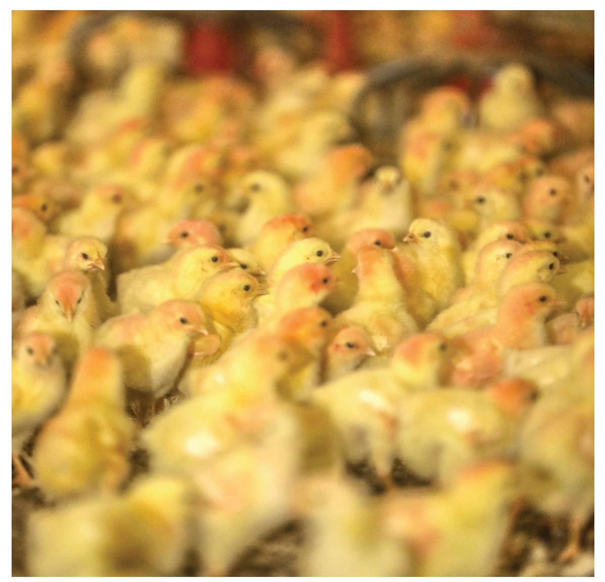
Coccivac vaccinated chicks in a broiler house.

Initial stocking density plays a critical role in subsequent cycling of Coccivac oocysts in the chicken house. Higher bird concentration (high density) may result in litter moisture control issues and result in higher exposure to more infective oocysts. Lower bird concentration (low density) may result in less sporulation and less exposure to infective oocysts. Release of birds from the brood chamber must be managed properly, in order to promote continuous recycling of oocysts and consequent development of immunity. As a result, high density flocks may require release from partial-house brooding earlier than low density flocks, even during winter months. When considering stocking density, feeder and drinker space should not be sacrificed.