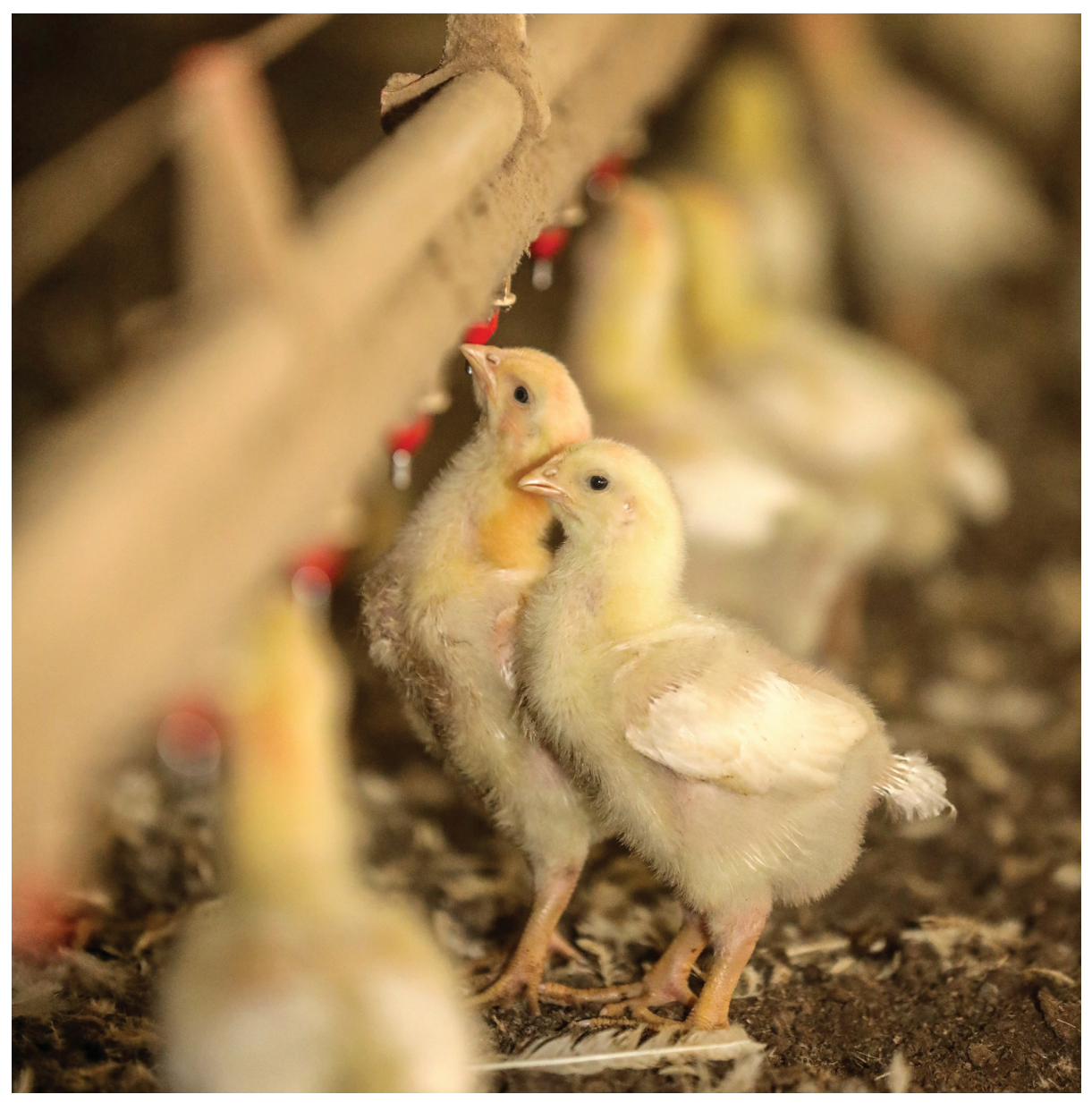
Proper drinker height is important for maintaining dry litter conditions.