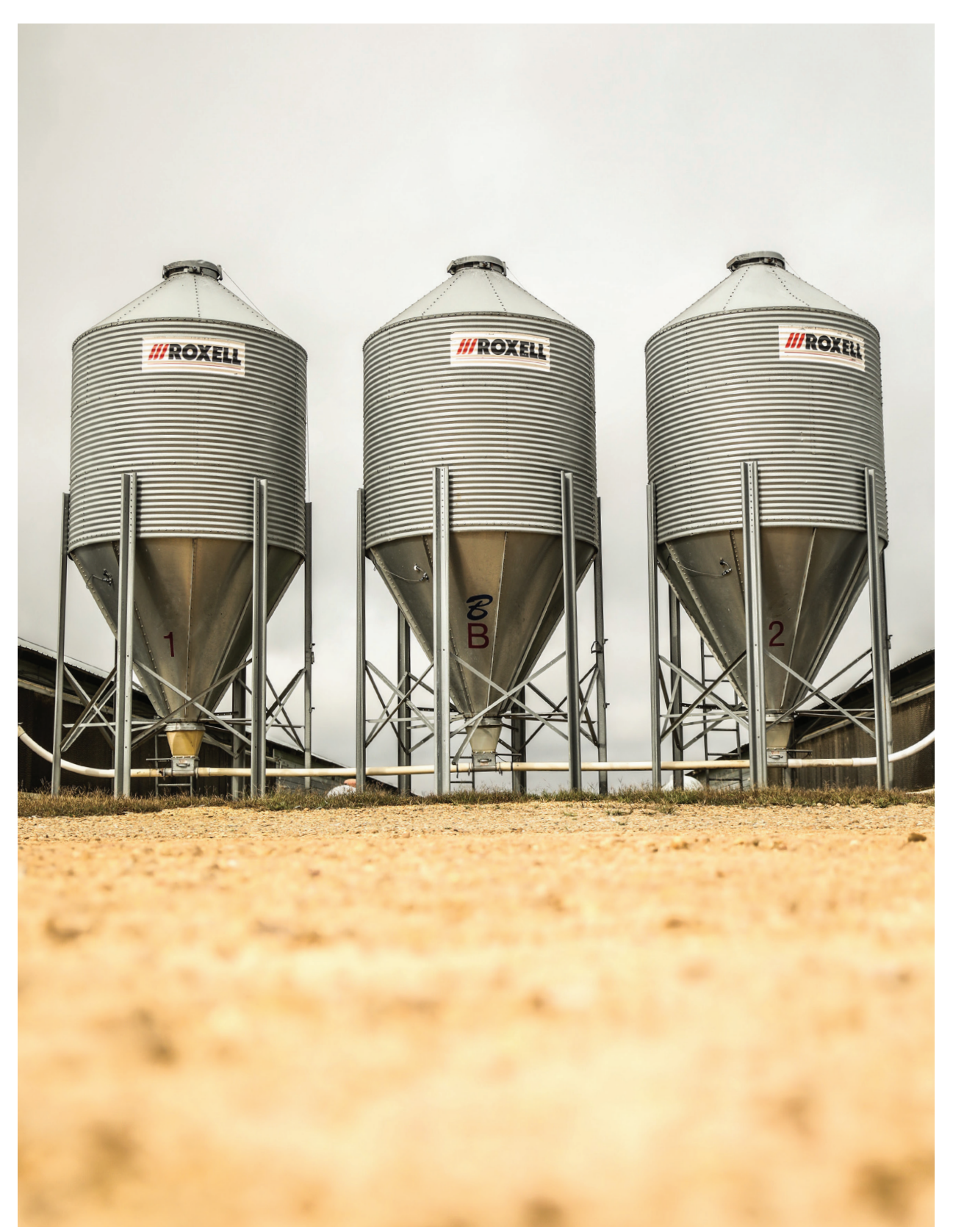
Multiple feed bins improve on farm feed management.