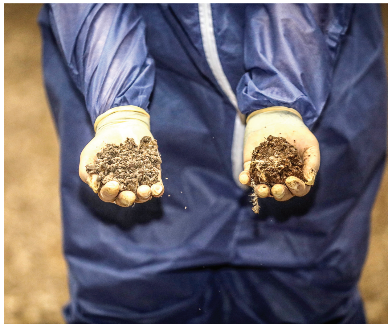
Adequate litter moisture is important for good coccidial cycling. Avoid too much litter moisture (sample on the right, above), which can cause higher oocyst levels.

Monitor litter moisture several times during the brooding period. Forming a ball with a handful of litter, which temporarily holds its shape before falling apart is a quick and easy method to determine adequate litter moisture (RH). If the litter remains in a ball, then moisture content is \geq 35%, which may result in excessive sporulation and higher oocyst levels.