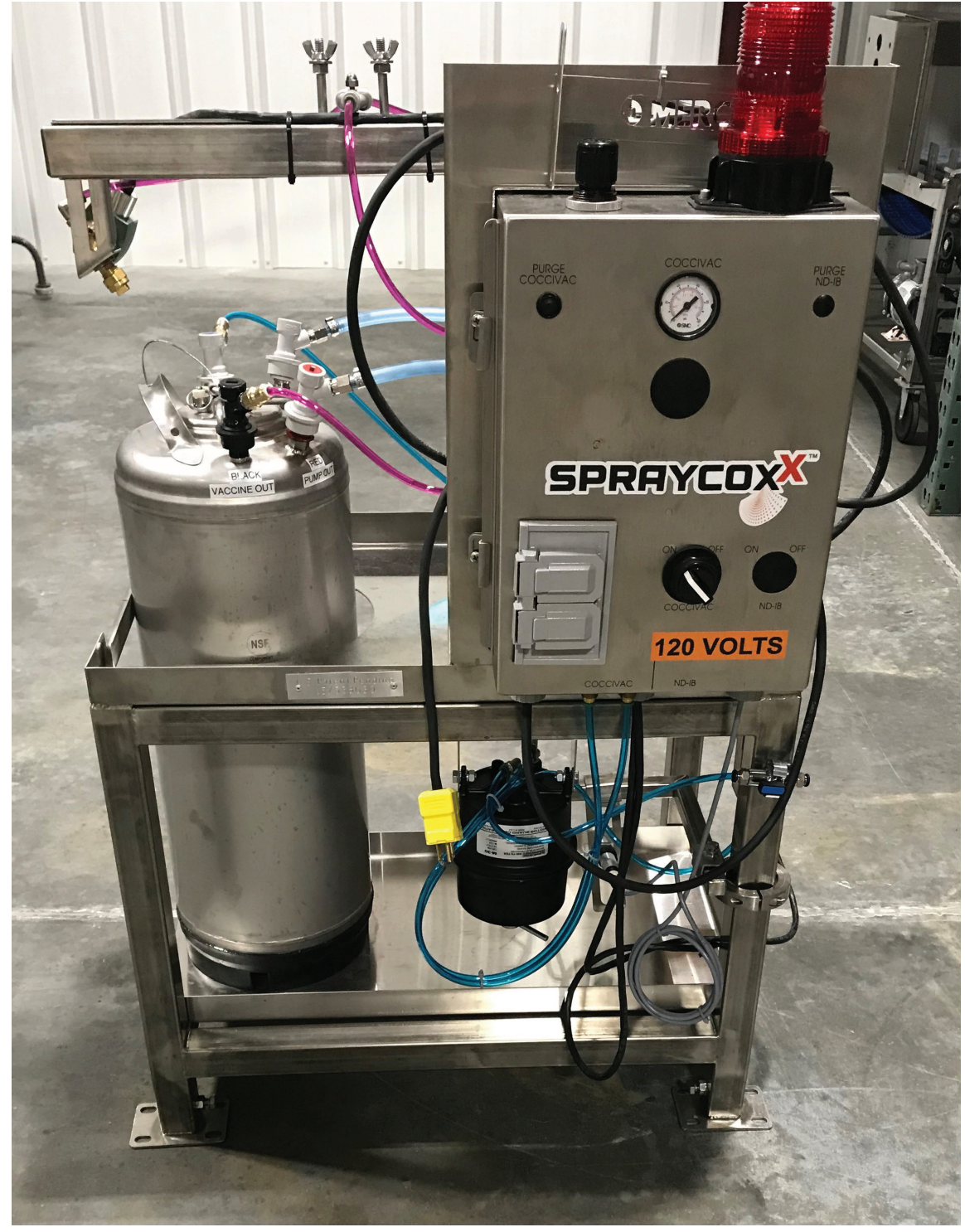
Latest generation Spraycox X spray cabinet for Coccivac application in the hatchery.

Spraycox<sup>®</sup> II and Spraycox X<sup>™</sup> spray cabinets have been developed to accommodate hatchery design and chick processing volumes. Only these application systems should be used for Coccivac vaccines.