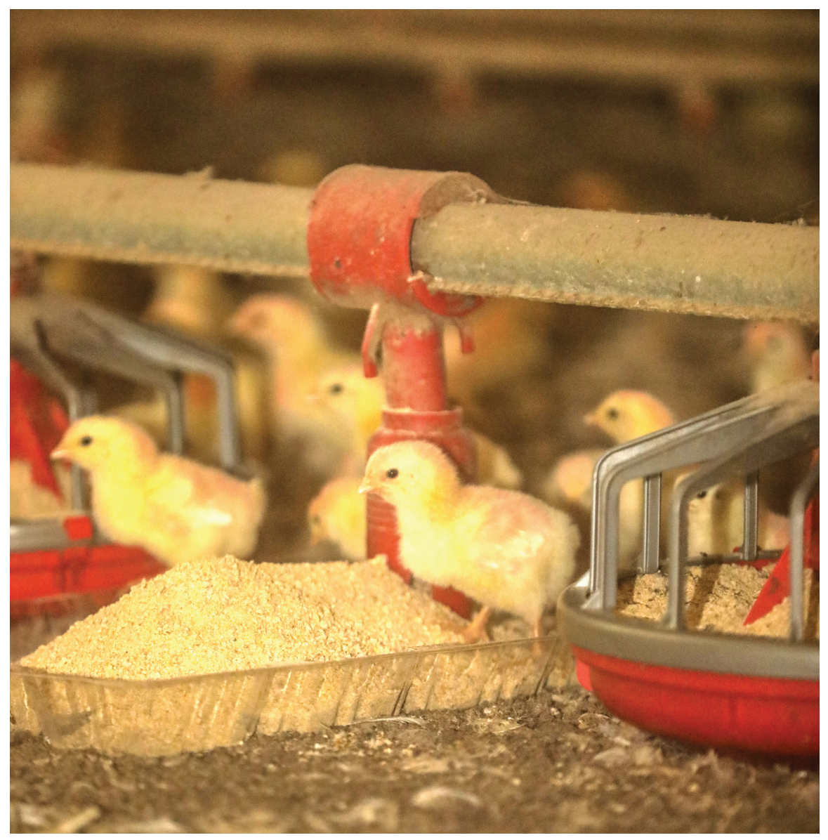
Example of readily accessible feed during brooding.