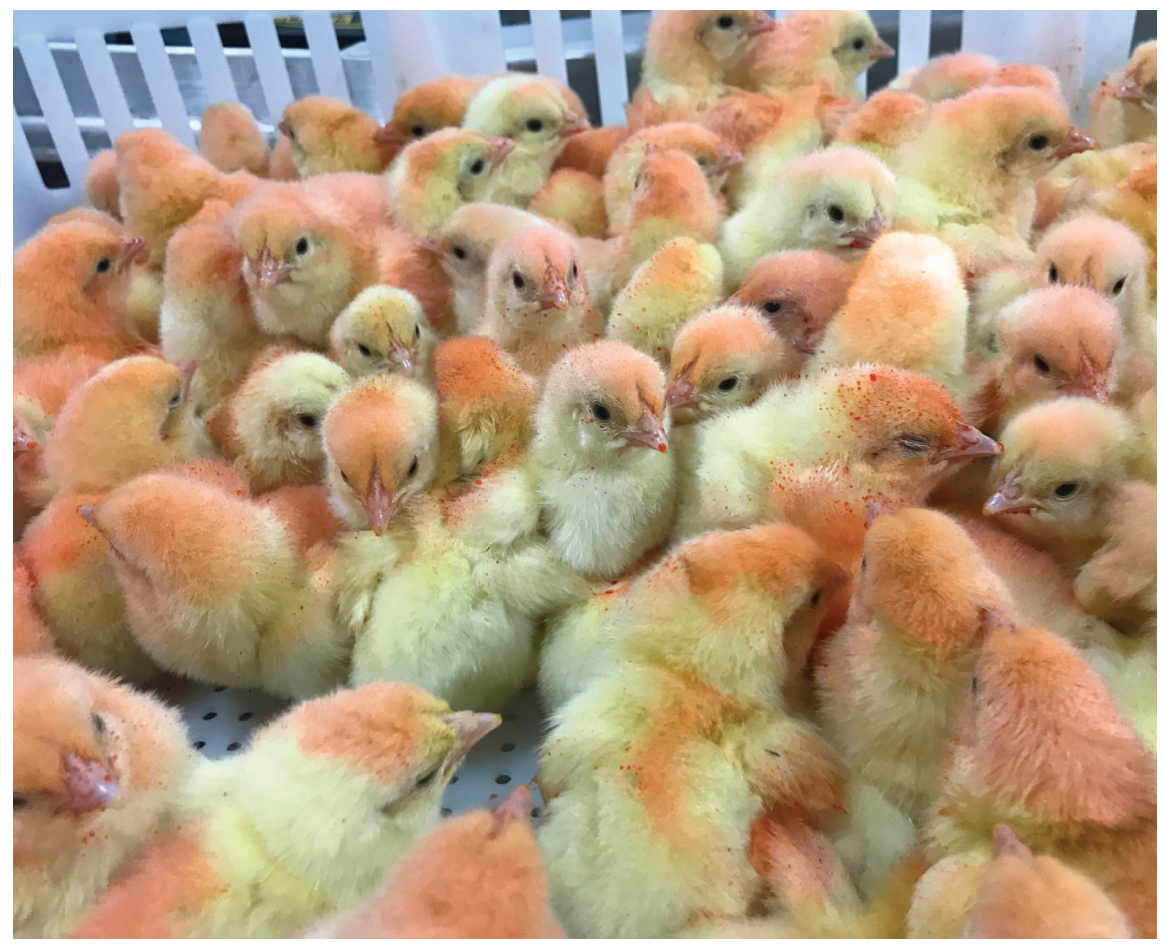
Example of evenly covered chicks following vaccination with Coccivac when using red dye.

The Spraycox cabinet delivers a uniform 21 ml dose by coarse spray for each box of 100 chicks. Monitor equipment daily to ensure proper calibration of volume and spray pattern.