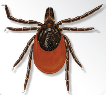
DEER TICK (ENLARGED VIEW)

Lyme disease is a bacterial infection transmitted by ticks to dogs, other animals, and people. Most Lyme disease in the United States is spread by the deer tick (pictured below), which is found primarily in the Northeast, Southeast, and Upper Midwest. The western black-legged tick is the primary source of Lyme disease transmission in the western states. 1